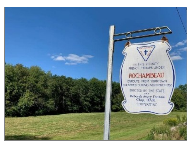
Sign marking the route of Rochambeau's

Samuel Dorrance's Inn is one of a few places mentioned by name in multiple accounts written by French officers. It is one of the sites along the 3.6 miles of the "March Route" of Rochambeau's Army on the Plainfield Pike. The trail covers 120 miles through Connecticut. A neighbor told me that this field was once part of the 22 acre farm, and some of the troops set up camp here to guard Rochambeau's officers.